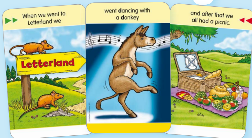
Pre-production b&w samples